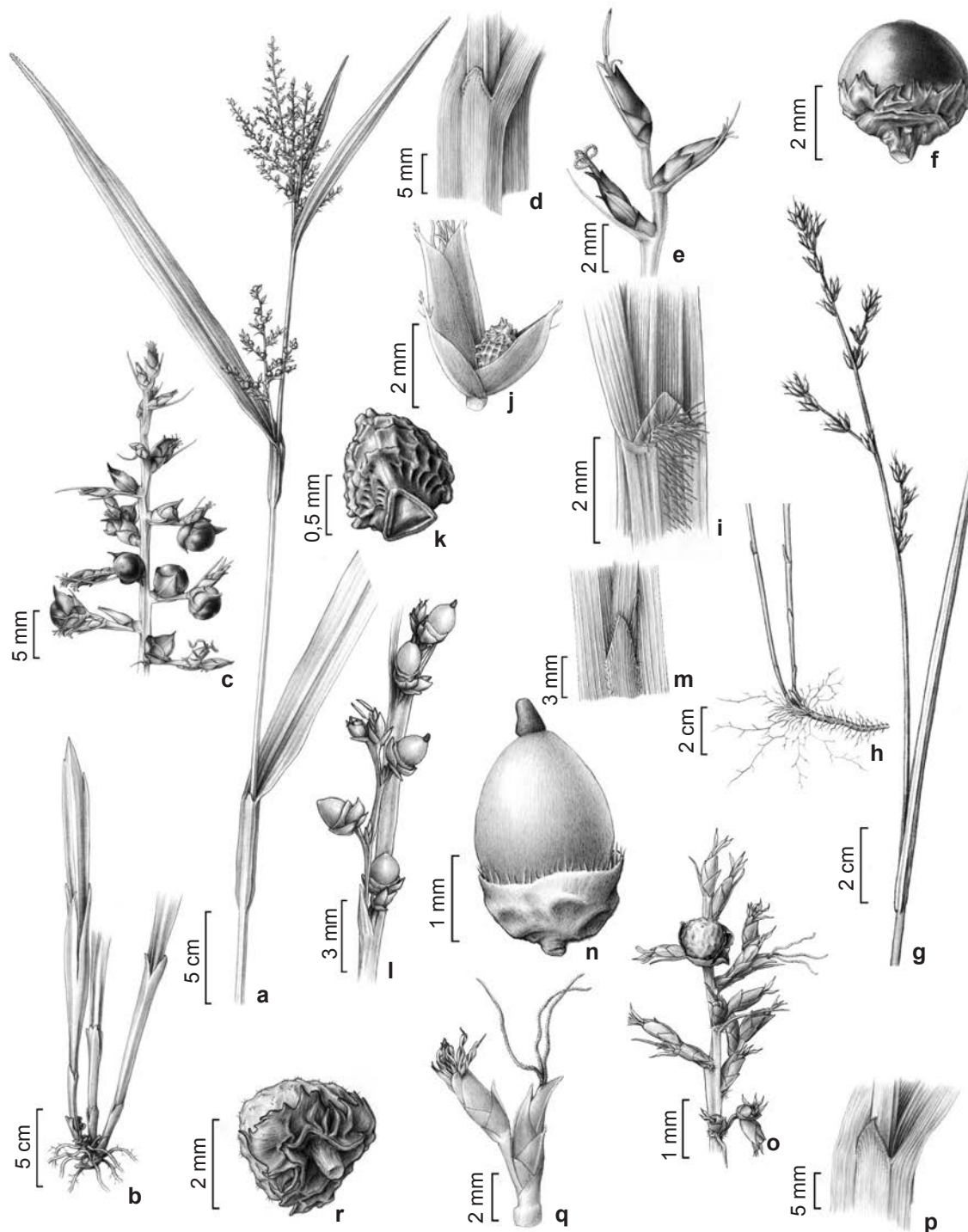
Figure 2 – a-f. Scleria latifolia (R. Affonso et al. 66) – a-b. habit; c. inflorescence; d. contraligule triangular; e. spikelets; f. achene smooth; hypogynium trilobed, margin fimbriate. g-k. Scleria leptostachya (R. Affonso et al. 182) – g-h. habit; i. contraligule pilose with a membranous appendage; j. spikelet bearing an achene at the base; k. achene reticulate-verrucose. l-n. Scleria microcarpa (G. Hatschbach 33663) – l. partial inflorescence; m. contraligule lanceolate; n. achene smooth; hypogynium cupuliform, margin ciliate. o-r. Scleria panicoides (R. Affonso & A. Zanin 204) – o. partial inflorescence; p. contraligule triangular q. spikelets; r. achene tuberculate, hypogynium trilobed, margins fimbriate.